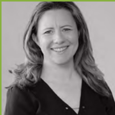
Partner Lightstone Ventures