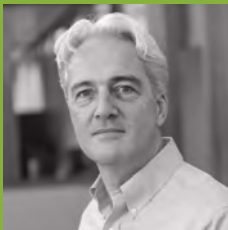
Executive Chairman & CEO S3 Connected Health